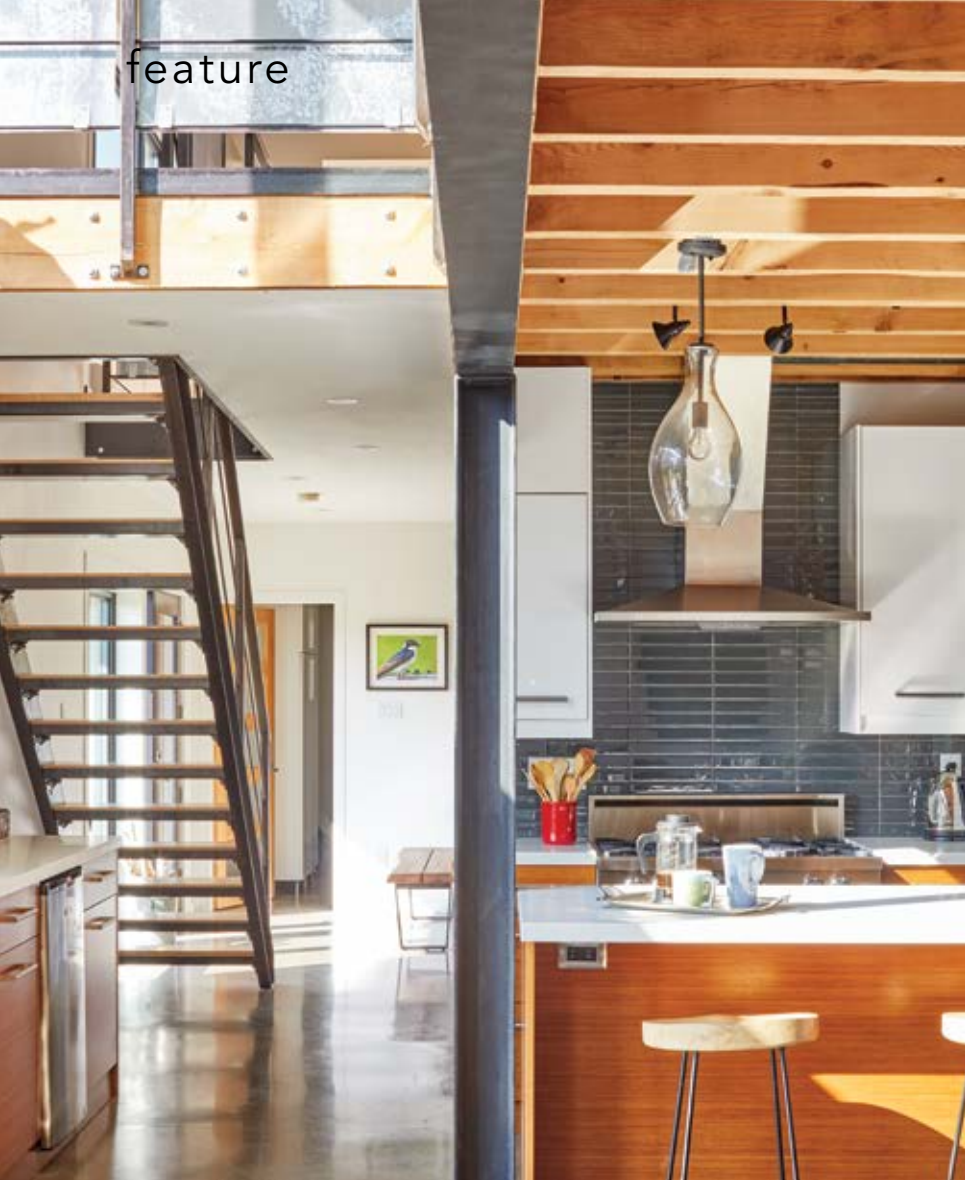
ABOVE: The modern staircase by welder Jay Mayes is a focal point of the house – the steel frame blending with the polished concrete floor and the modern lines of the kitchen make for a stunning entrance. RIGHT: A rustic pine tabletop pendant lamp combined with a modern steel pendant lamp work together to provide interest and warmth to the contemporary open-concept dining area. OPPOSITE, TOP: A high-gloss finish on Ikea cabinets mixes with warm wood on the island for a sleek but toasty vibe in the kitchen. BOTTOM LEFT: Texture plays a leading role in the home. Warm neutrals and natural fabrics combine with artefacts from family travels to soften the bright white walls in the living room. BOTTOM RIGHT: The staircase mimics one in a nearby Erin cafe.